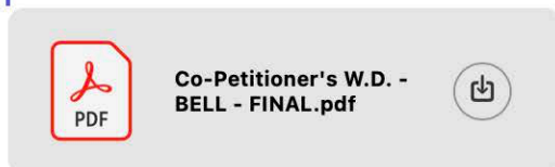
EXHIBIT III - PAGE 34 - Cost entry