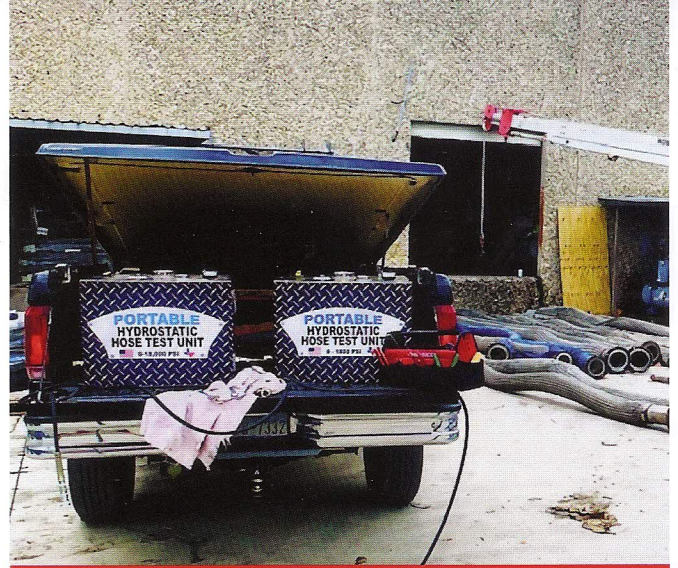
Field Services & Industrial Hose