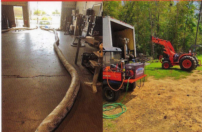
Chemical Plants & Agriculture