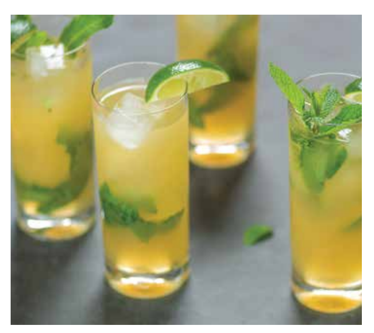
Recipe courtesy of the American Heart Association Discover more ways to improve daily routines at Heart.org/eatsmart

Nutritional information per serving: 45 calories; 0 g total fat (0 g saturated fat, trans fat, polyunsaturated fat and monounsaturated fat); 0 mg cholesterol; 7 mg sodium; 13 g carbohydrates; 0 g fiber; 10 g total sugars (0 g added sugars); 1 g protein.