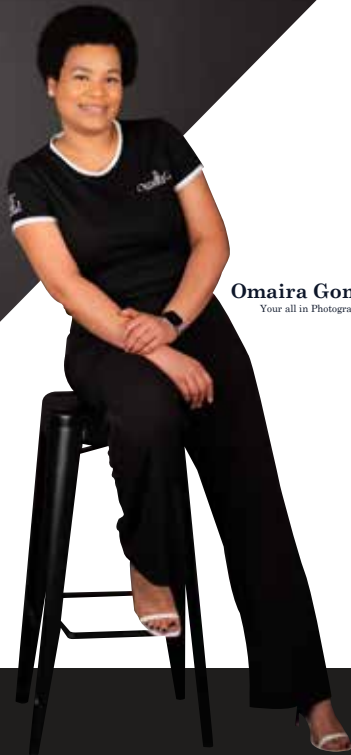
Omaira Gonzalez Your all in Photographer

Events & Weddings In Studio Or Outdoors Sessions Food And Products Photography