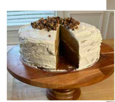
From the kitchen of Michelle Smith

2 CUPS UNSALTED BUTTER, SOFTENED 1 TSP. MAPLE FLAVORING OR MAPLE SYRUP ¼ TSP. SALT 5 CUPS CONFECTIONERS' SUGAR ¼ TO ½ CUP HALF-AND-HALF CREAM 3 TBSP. MAPLE SYRUP, DIVIDED