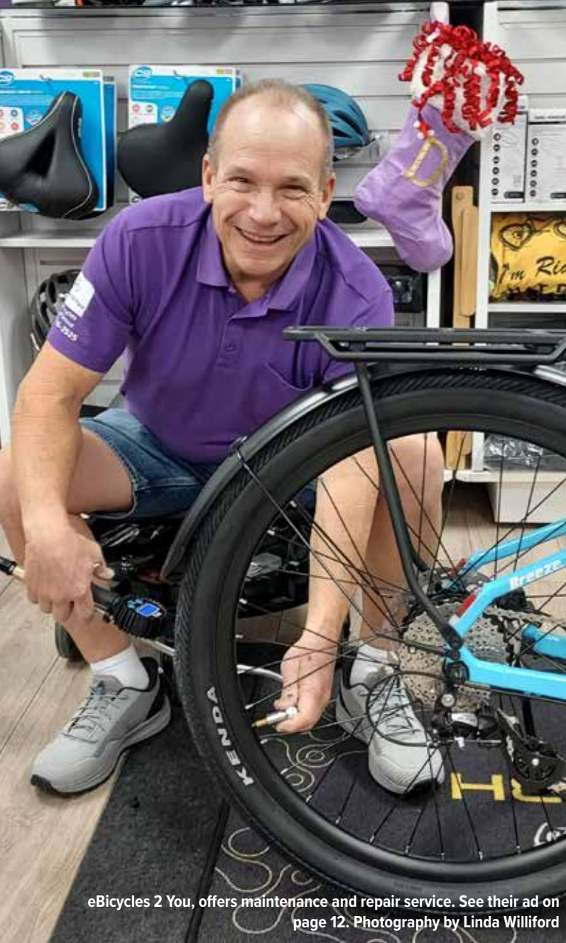
eBicycles 2 You, offers maintenance and repair service. See their ad on page 12.