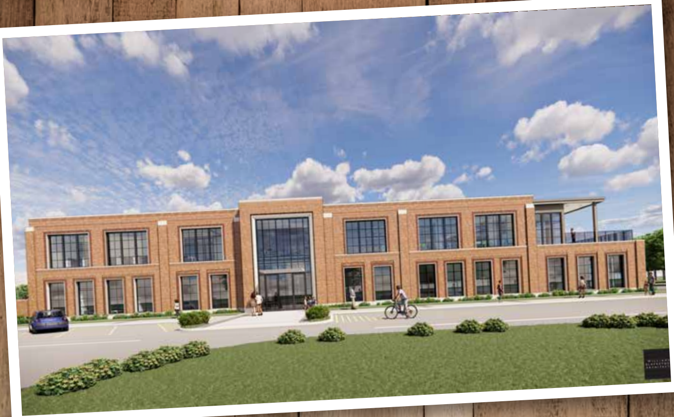
Architectural rendering of the new Foley Library. Photography provided

and bars while strolling around the district.