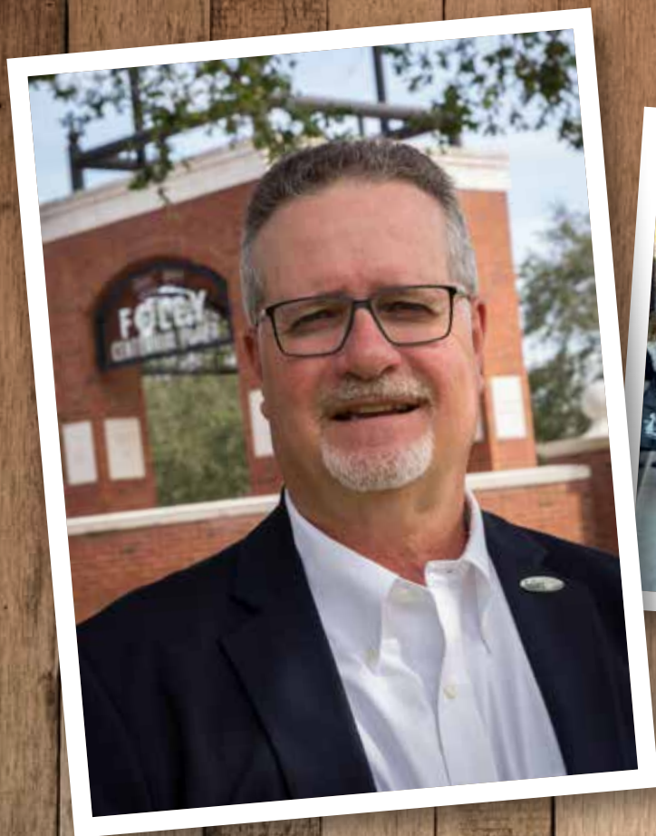
Mayor of Foley, Ralph Hellmich