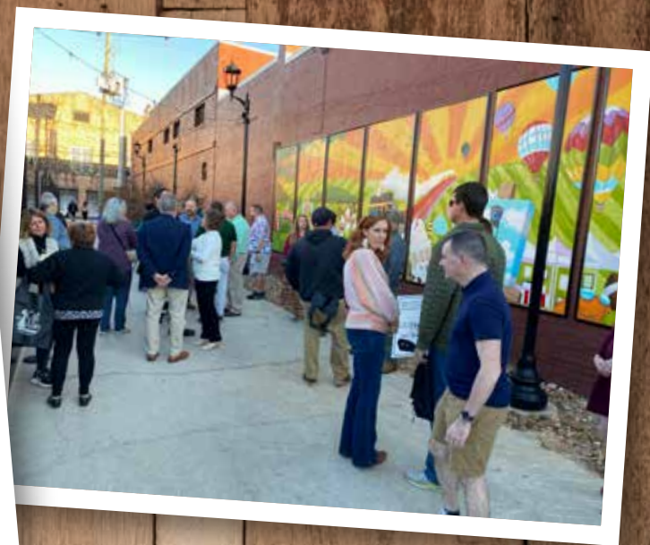
Downtown Foley's new Cat Alley Extension.