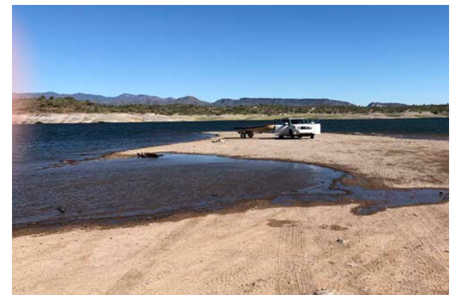
Lake Pleasant near Castle Hot Springs Boat Ramp