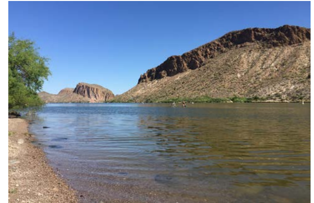
Canyon Lake Marina Campground Beach