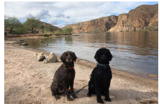
Canyon Lake near Palo Verde Boat Launch