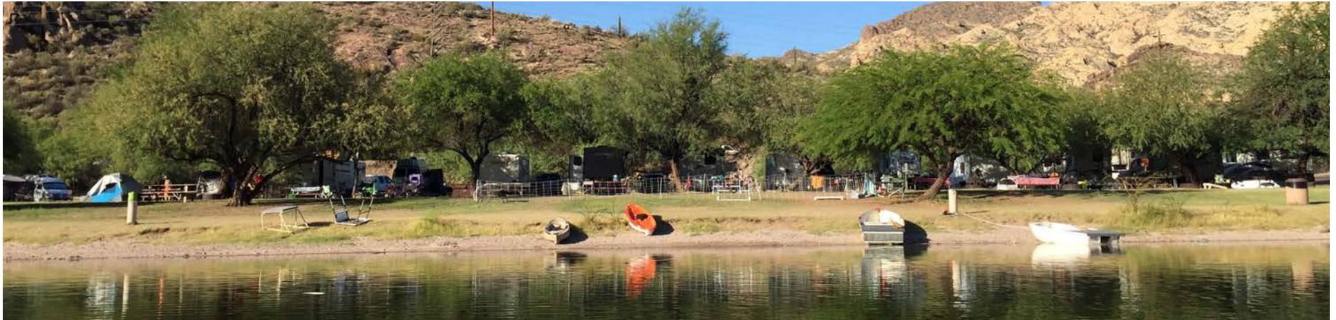
Canyon Lake Marina Campground Beach