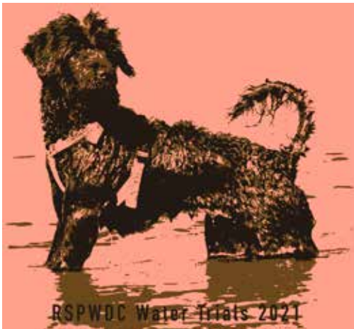
RSPWDC Water Trials 2021