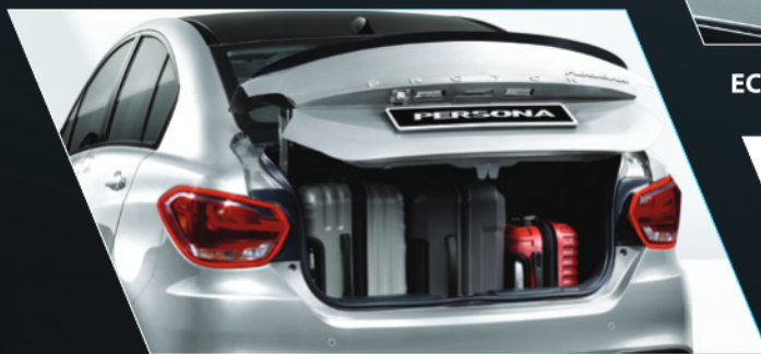
510L Boot Space