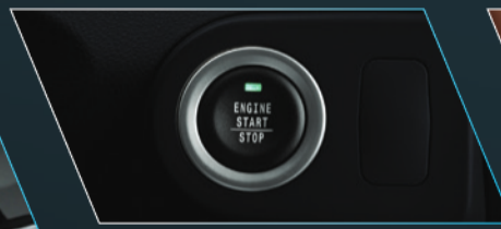
Push Start Button