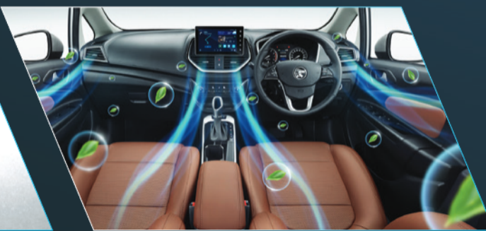
N95 Cabin Filter