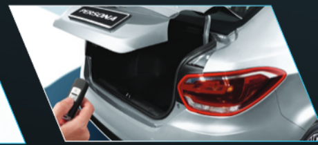
Remote Trunk Release