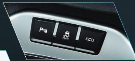
ECO Mode Switch