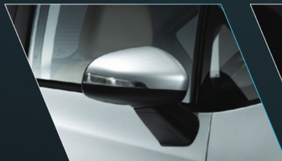
Electric Door Mirrors with Auto Fold Function