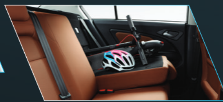
Rear Seat 60:40 Split Fold