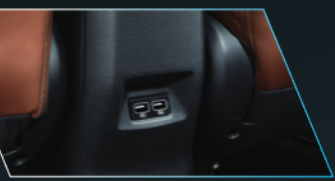
6 USB Ports

Never run out of USB ports; with 3 at the front, 2 at the rear and 1 behind the rear view mirror to power the dash cam.