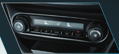
Air-Conditioning with Digital Display