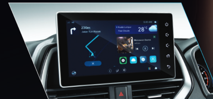
8" Floating Infotainment Head Unit

Offering connectivity that is unmatched by any other vehicle in its class, feel in command as you connect to the PERSONA for communication, navigation and entertainment options.