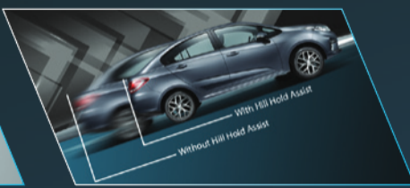
Hill Hold Assist