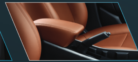
Front Armrest with Console Box