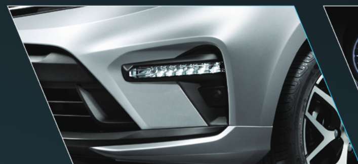
LED Daytime Running Lamps