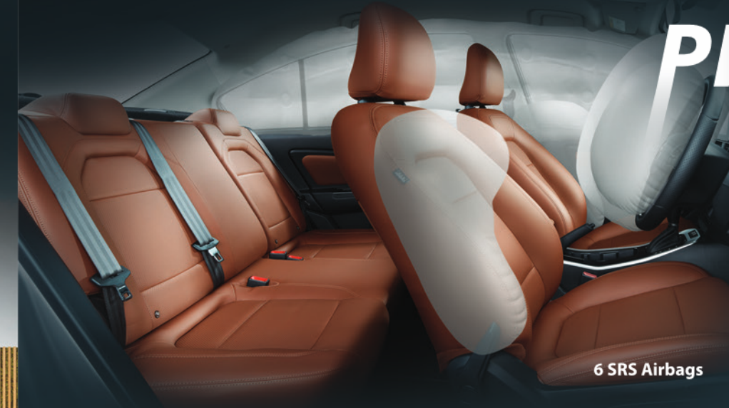
6 SRS Airbags