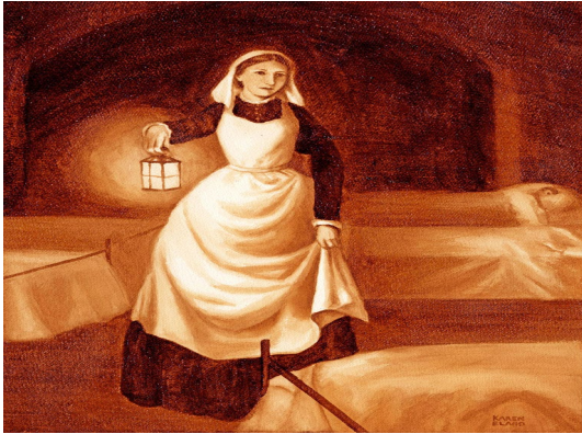
Florence Nightingale: The Lady with the Lamp

The Florence Nightingale Lamp is an enduring emblem of the nursing profession, symbolizing knowledge, vigilance, and compassion. It derives its powerful meaning from Florence Nightingale, "The Lady with the Lamp," who carried an oil lamp on her nightly rounds to tend to wounded soldiers during the Crimean War.