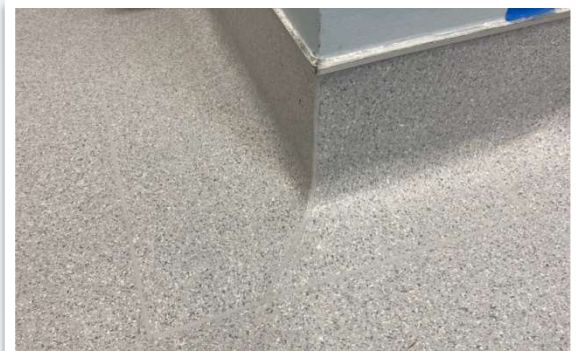
Finished corner with heat welding