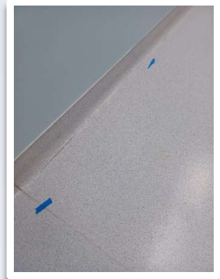
Cracked vinyl cove base that needs repaired