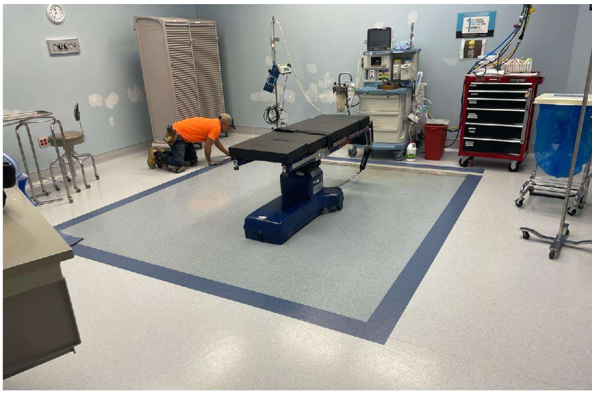
Application of new vinyl borders