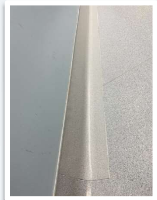
New vinyl cove base