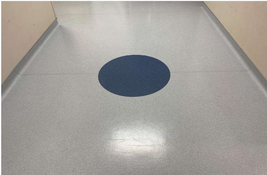
Vinyl inlay installed