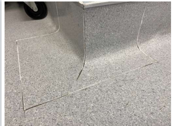
Corner w/new vinyl, prior to heat welding