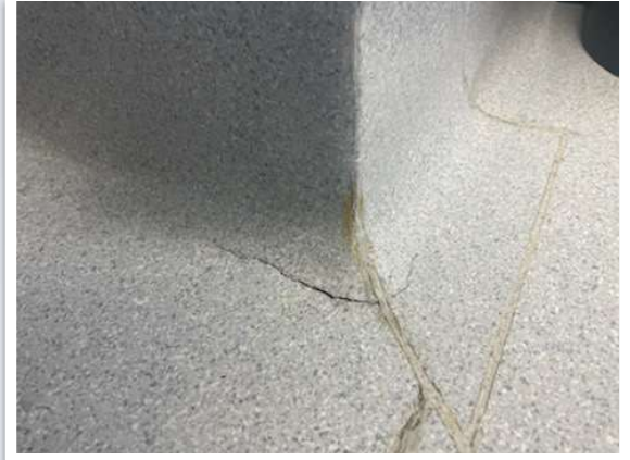
Cracked cove corner