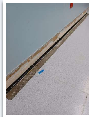
Removal of old vinyl