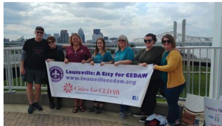
Survivors' Corner joins CEDAW to raise awareness on discrimination against women