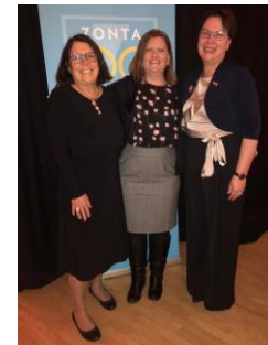
Survivors' Corner delivers the keynote speech in Helsinki, Finland at the Zonta International Centennial Conference

Survivors' Corner was invited by multiple women's empowerment and victim services organizations to present at public awareness events. We provided education on complex trauma, the intersectionality with child abuse and lifelong harms, and policy reforms necessary to break abusive cycles and empower survivors towards healing. Our outreach resulted in numerous survivors disclosing their experiences to us and becoming involved in the movement to authentically deepen healing and consult on more protective practices.