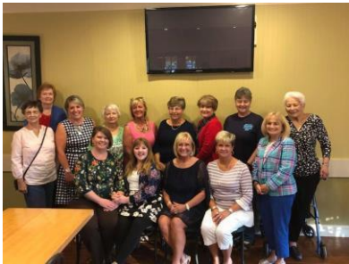
Survivors' Corner presents at Zonta Club of Elizabethtown area meeting