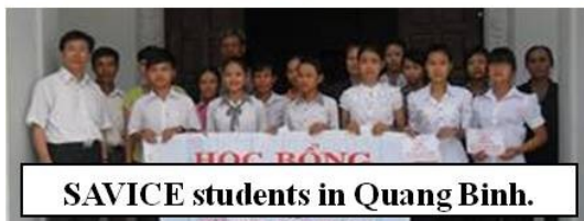
SAVICE students in Quang Binh.