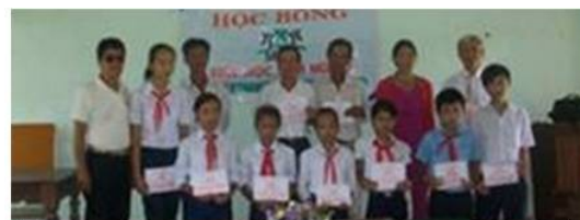
SAVICE students in Truoi village, Hue