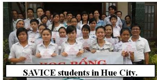
SAVICE students in Hue City.