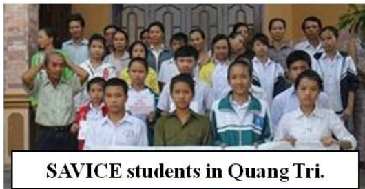
SAVICE students in Quang Tri.