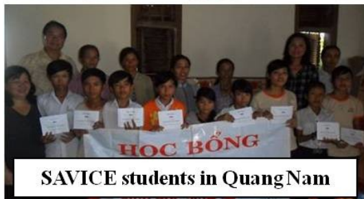
SAVICE students in Quang Nam