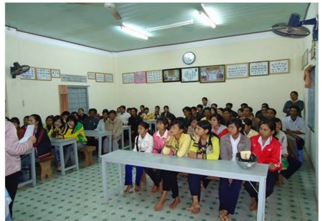
SAVICE students in Pleiku

Nguyen Thi Thu Sang Pleiku, September 3, 2011