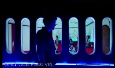
ONLY GOD FORGIVES

THE STYLE OF FILMING O'SHEA WILL BE THE USE OF STYLIZED CAMERA WORK AND A BREATHING CAMERA. GRAND SWEEPING PANS AND DRONE SHOTS, HANDHELD SHOTS AND WITH DIRTY OVER THE SHOULDER SHOTS. MIXING THESE CAMERA STYLES WILL PULL THE AUDIENCE IN AND EMERGE THEM IN THE WORLD OF O'SHEA.