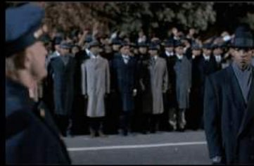
←→ MALCOLM X