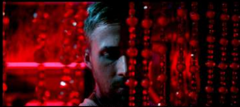
ONLY GOD FORGIVES

O'SHEA WILL USE COLOR TO FURTHER EXPRESS THE STORY. EVERY COLOR SEEN ON SCREEN WILL HAVE A MEANING.