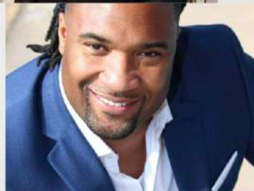
EXECUTIVE PRODUCER ANTRONE HARRIS