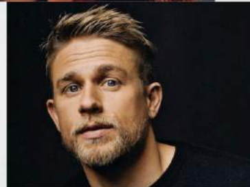
BOBBY "BLOODY MOUTH" JOHNSON CHARLIE HUNNAM