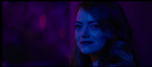
LA LA LAND