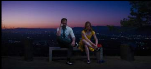
LA LA LAND