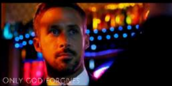
ONLY GOD FORGIVES