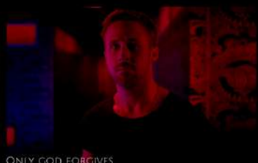
ONLY GOD FORGIVES