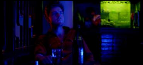
ONLY GOD FORGIVES