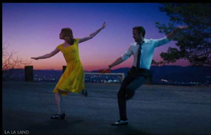
LA LA LAND