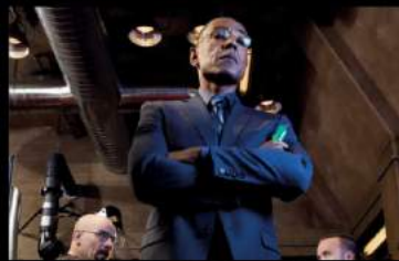
←→ BREAKING BAD

THESE DIFFERENT SHOWS/FILMS HAVE STRONG CHARACTERS WHO ALL HAVE A PURPOSE FOR WHY THEY ARE WHO THEY ARE AND MAKE THE CHOICES THEY MAKE. NON ARE PERFECT AND ALL HAVE THEIR DEMONS. SHOWING THAT IT IS IMPORTANT FOR US TO SHOW A BALANCE OF GOOD, BAD AND IN-BETWEEN