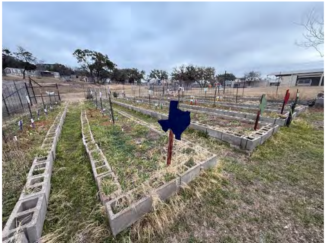
The February garden is bare, waiting for planting!