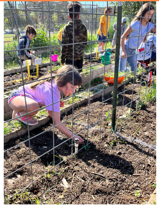
Discovery Garden at the Hunt School