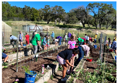
Each student has a Garden Buddy