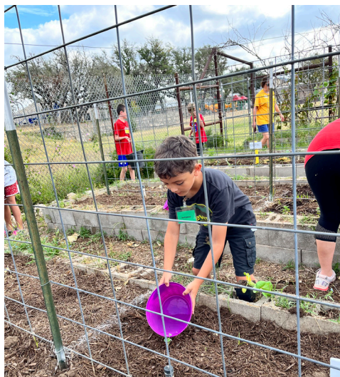
Watering the seeds

Two weeks after planting seeds... lettuce, radishes and ..... weeds!