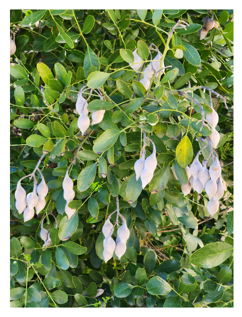
HISD Wildscape (Carla Stang) -

We are all anxious to get our pruning shears on those plants at the Wildscape! With the warm weather we've been having it's tempting to get in there and whack down the unattractive stems and tidy things up. But we will exercise patience and wait and watch the new growth continue...and hope we don't have another freeze that will set the plants back a bit. The Bluebonnets continue to grow and show themselves, but haven't bloomed yet. The Mountain Laurel that bloomed so prolifically last year has a lot of seed pods this year and has a pretty nice set of blooms again.