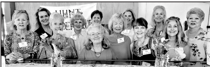
May 2022 Luncheon hostesses

Wait until the business portion of the meeting is over with before cleaning dishes from the tables. Doing so during the meeting is too distracting. After the meeting, fold up tables and chairs.