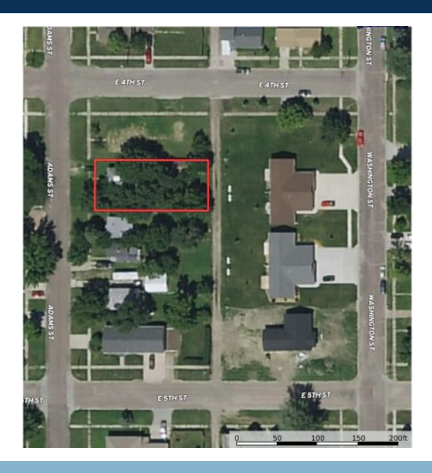
Brought to you as a courtesy of: