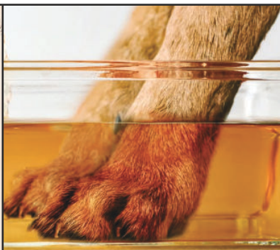
DIY Allergen-Removing Paw Soak

As allergy season approaches, one of the most common complaints is itchy, irritated paws. If your pet is constantly licking, chewing, or scratching their paws, it could be a sign of seasonal allergies .