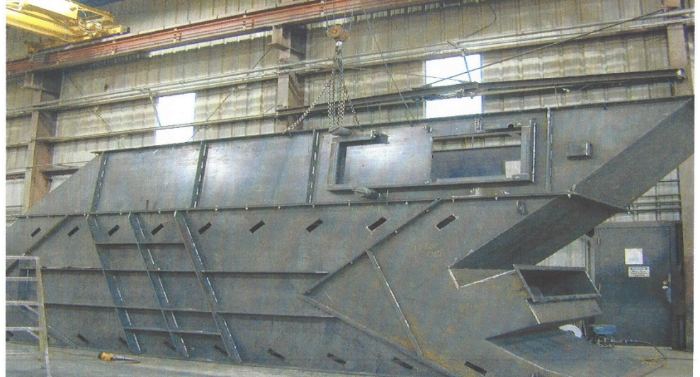
Machining & Fabrication