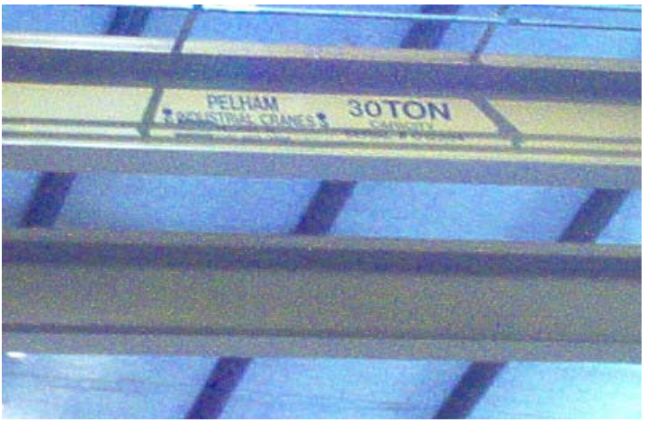
16 Shop Cranes from 3-Ton underhung to 50-Ton top running double girder