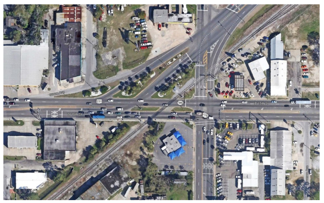
Existing US 231, 75 & 98 Intersection before the 'proposed' Loop