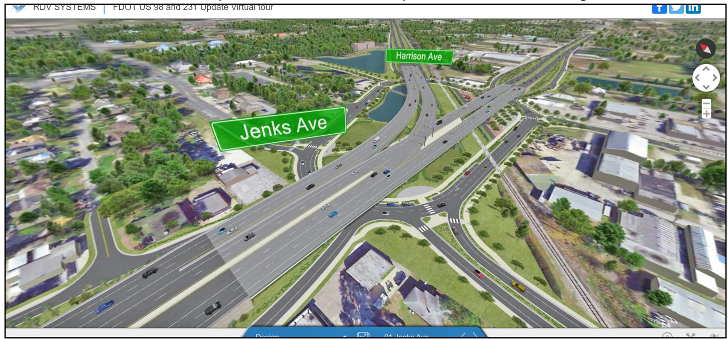
Project Owner: Florida Department of Transportation, D3