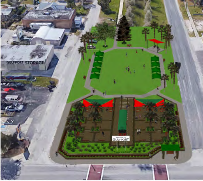
OVERALL PERSPECTIVE VIEW