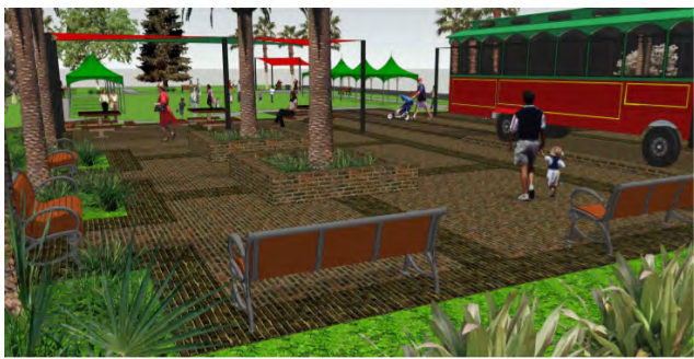
VIEW OF TROLLEY MARKET PLAZA