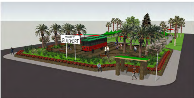
VIEW ALONG 49 STREET SOUTH