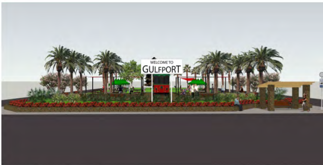
VIEW ALONG 49 STREET SOUTH