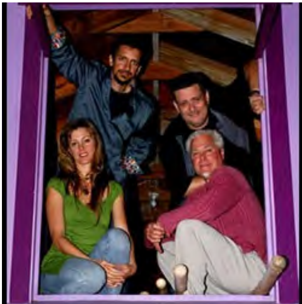
URBAN GYPSIES WILL BE PERFORMING AT THE TROLLEY MARKET SQUARE GRAND OPENING EVENT

There will be speeches by dignitaries. live music all day, a market, maybe a classic car showing, give away basket drawings, free hot dogs, soda and chips for all that attend and, of course, the dedication of the Granite Monument, so watch for the opening date.