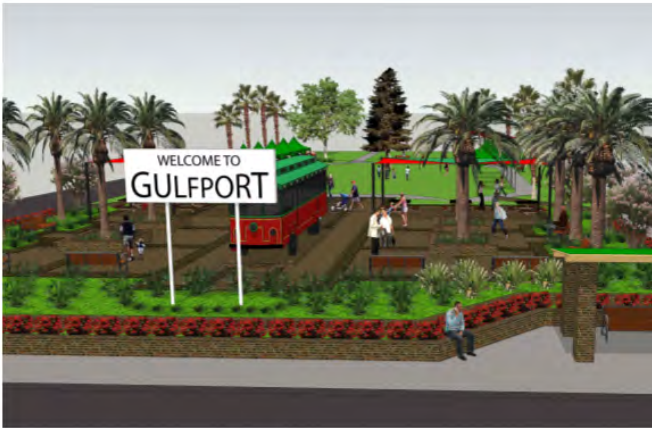
VIEW ALONG 49 STREET SOUTH

TANGERINE GREENWAY - TROLLEY MARKET SQUARE CONCEPTUAL EXHIBITS COURTESY OF CARDNO, PLACEMAKER DESIGN STUDIO, LLC, CITY OF GULFPORT, FLA