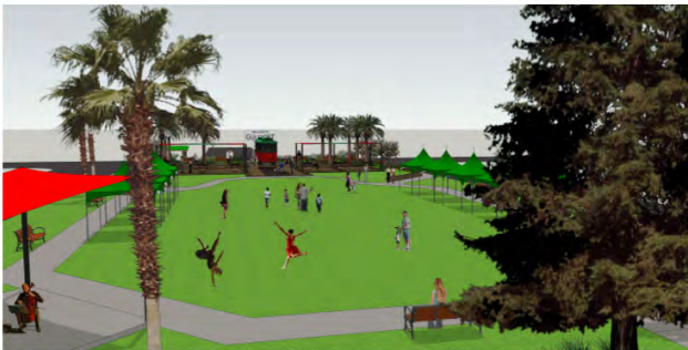
VIEW OF FESTIVAL SPACE LOOKING EAST