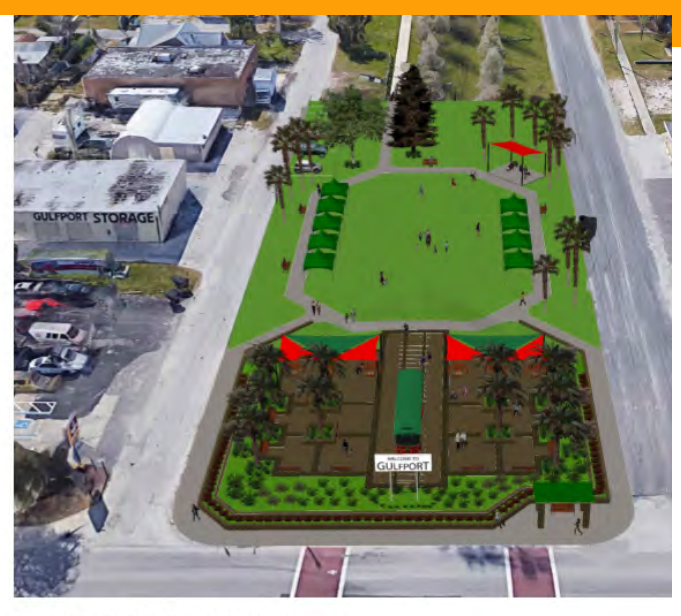
OVERALL PERSPECTIVE VIEW