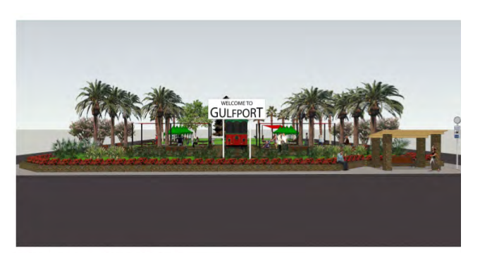
VIEW ALONG 49 STREET SOUTH