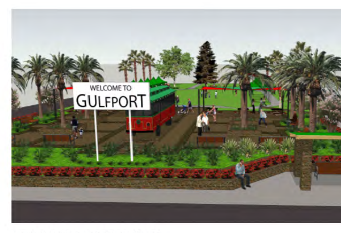
VIEW ALONG 49 STREET SOUTH

TANGERINE GREENWAY - TROLLEY MARKET SQUARE CONCEPTUAL EXHIBITS COURTESY OF CARDNO, PLACEMAKER DESIGN STUDIO, LLC, CITY OF GULFPORT, FLA