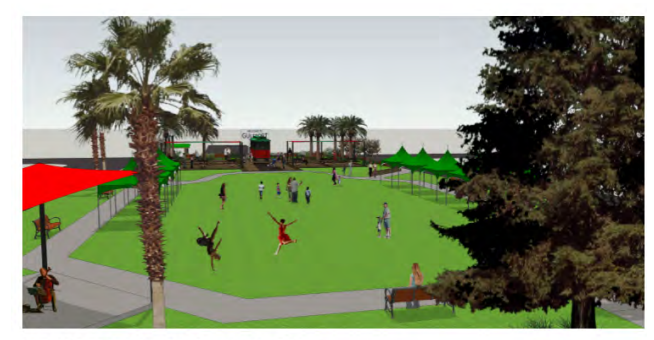
VIEW OF FESTIVAL SPACE LOOKING EAST