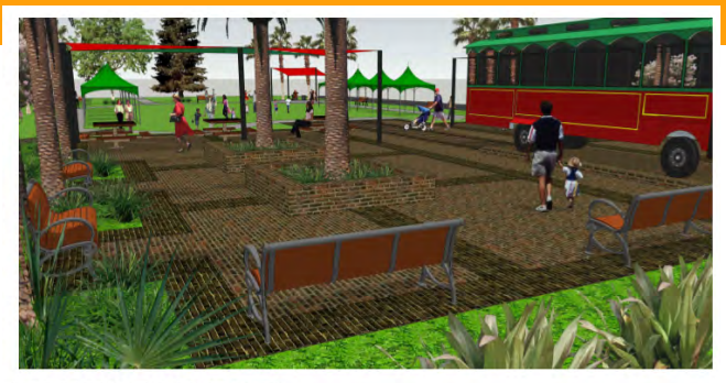
VIEW OF TROLLEY MARKET PLAZA