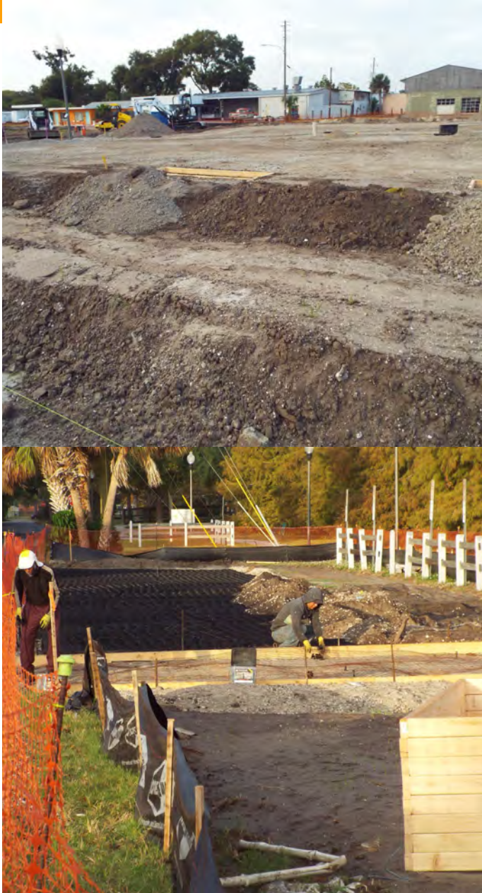
TANGERINE GREENWAY - TROLLEY MARKET SQUARE CONSTRUCTION IN PROGRESS