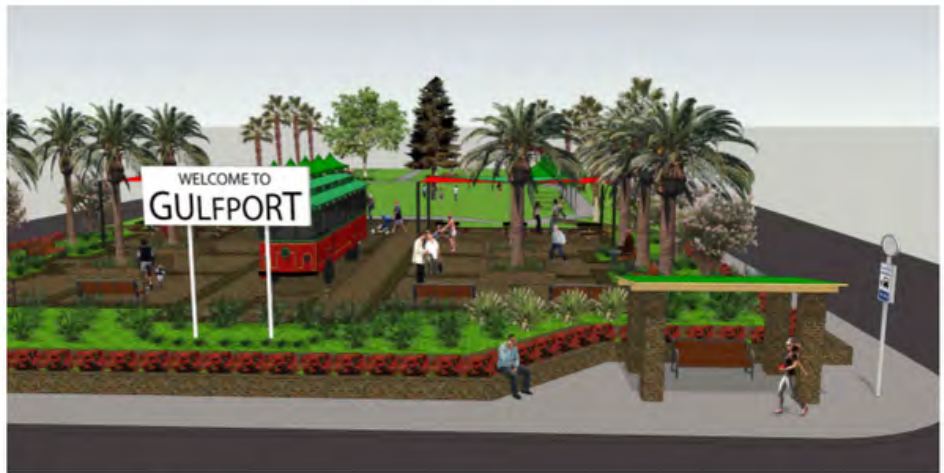
VIEW ALONG 49 STREET SOUTH

We are bringing back the Music Festival in 2019 so watch for that date and Saturday morning Markets and maybe Movies in the park. Our membership is open to all and you are welcome to join contact us today. Our members get free booth spaces at 2 events during the year, included in our monthly news letter and so much more.