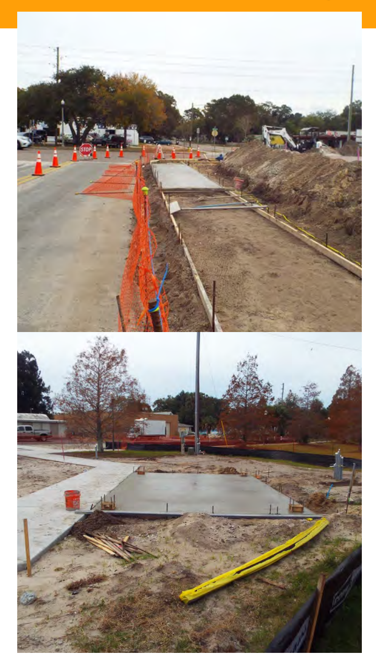
TANGERINE GREENWAY - TROLLEY MARKET SQUARE CONSTRUCTION IN PROGRESS

Duke energy has installed new main power lines up to the venue, a reinforced grass parking area has been installed and a new handicap space. The city crews have installed irrigation lines for the new planter areas. You can follow the daily activity by logging on to our face book page www.facebook.com/SO49