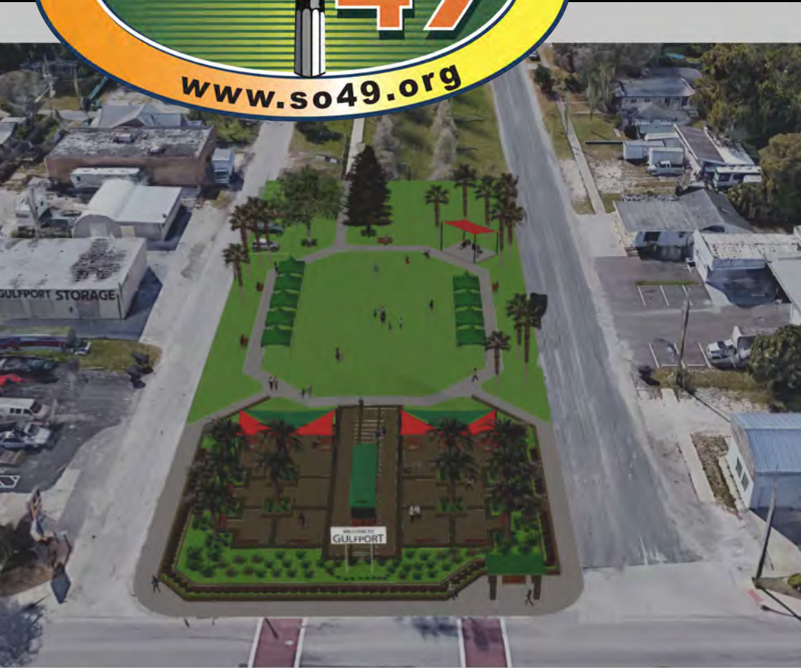
OVERALL PERSPECTIVE VIEW