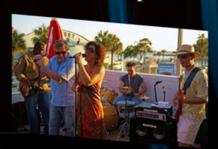
My Viking Funeral