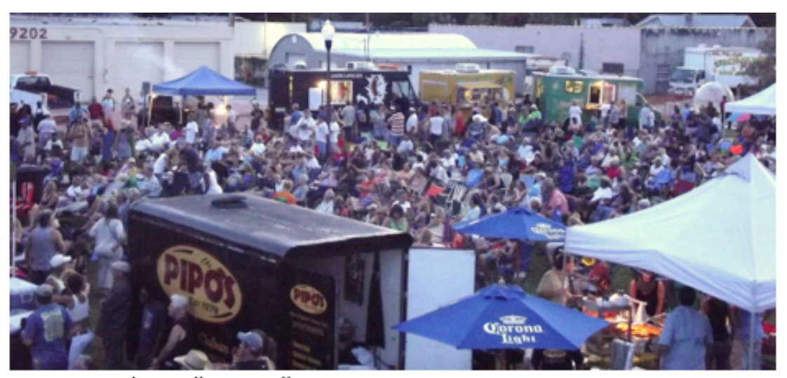
6:00 PM Sundown elbow to elbow

Mail applications to 49th street south business association P. O. Box 531042 St. Pete FI, 33747: Make checks payable to (South 49th street Business Association).