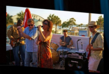
My Viking Funeral