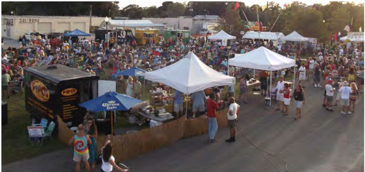
3:00 pm still growing