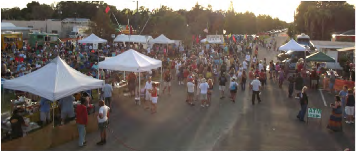
5:00 PM Still Growing