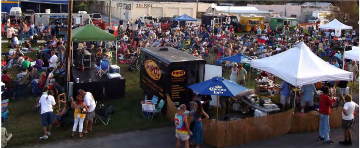
2:00 pm crowds start to grow