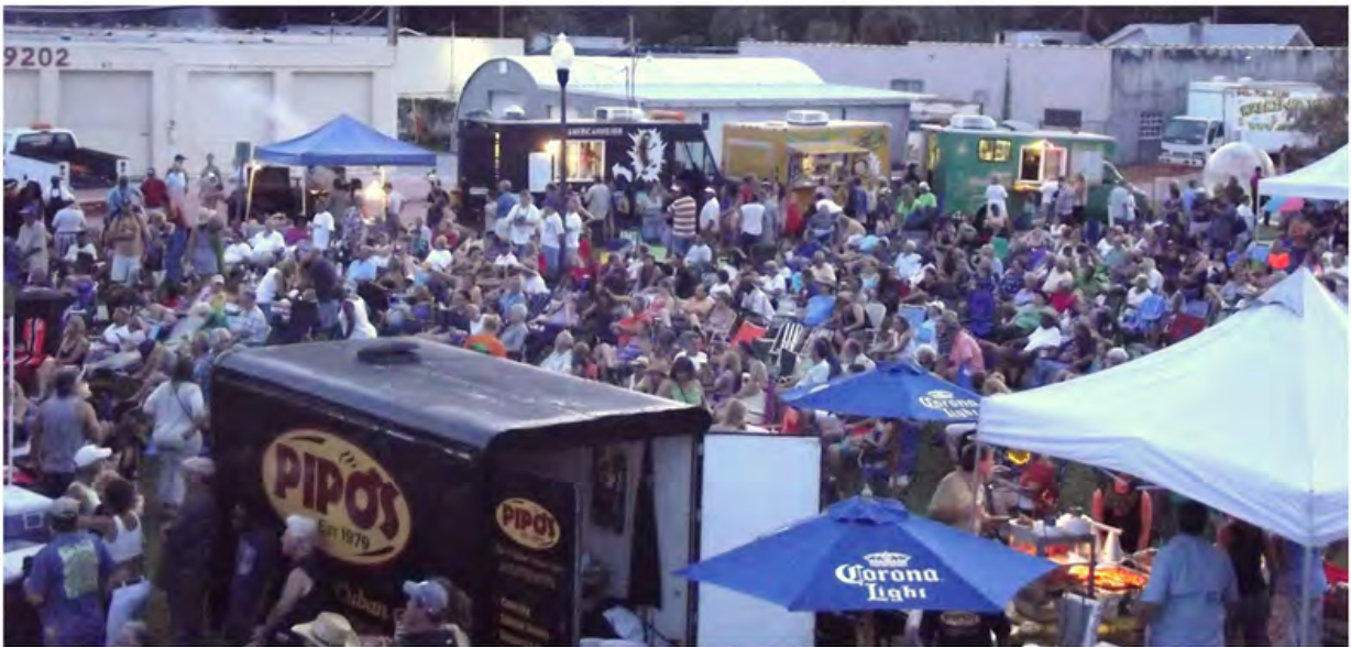
6:00 PM Sundown elbow to elbow

Be a part of the bay area's best free music Festival Sponsor Today!