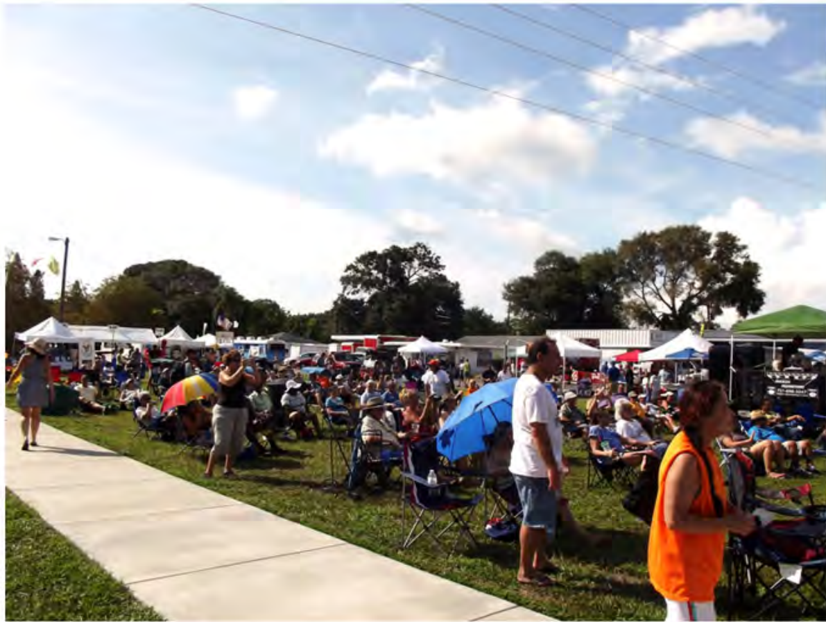
12:00 noon crowds gather

Be a part of this wonderful project and you can enjoy crowds like the following last Festival