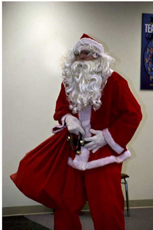
Santa Claus was there too!!