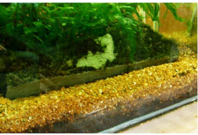
Partly clean 1

We think these fish, sometimes called ‘Siamese Algae Eaters’ or ‘Siamese Flying Foxes’, are worth their weight in gold. But, be careful to get the right species because there are some similar looking fish that just can’t do the job.