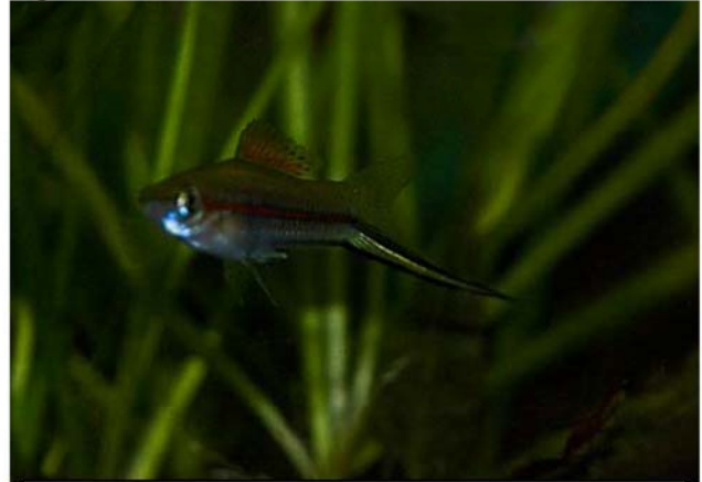
Male Uplander Sword

This species as with most swords needs no special care. Just the same you should avoid extremes in water temperature and water hardness. Despite being found in fast moving streams in the wild it does not require this in the aquarium. Some water movement is a good idea, water movement from a small power filter or even a sponge filter is a good idea.