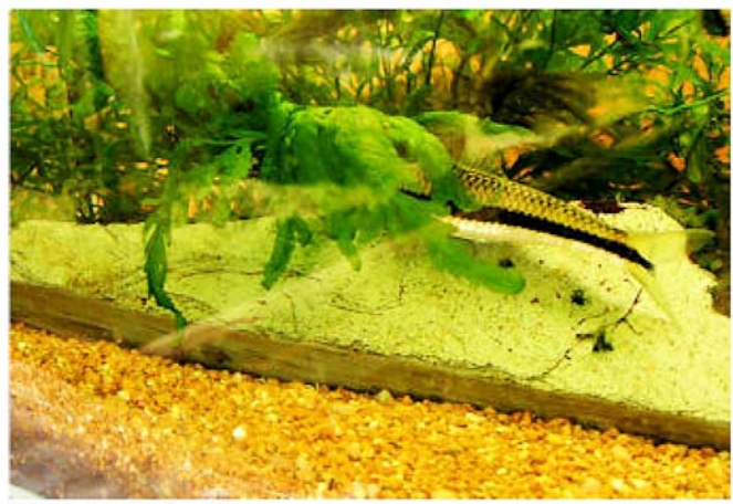
Finishing touches 1