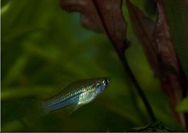
X.alvarezii female

Xiphophorus alvarezii is an uncommon (in this area at least) swordtail even though it was described over 40 years ago. It's range includes the upland basin of Chiapas, Mexico and that is why it is commonly known as the Uplander Sword , or the Chiapas Swordtail .