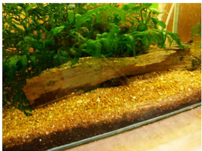
Cleans logs too