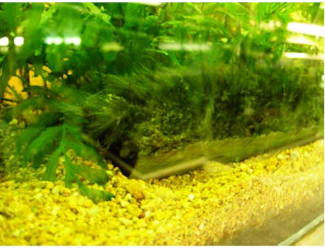
Algae covered slate