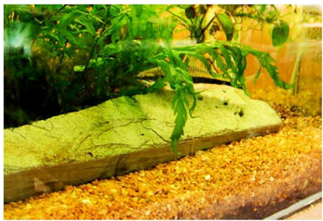
Finishing touches 2