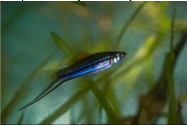
X.alvarezii male

It looks similar to other swordtails in the Xiphophorus hellerii complex. The adult male's sword can reach a length of 4 to 6cm and that places it firmly in the short-sworded complex. The sword is yellow, or gold with black edges. X.alvarezii has two or more red lines along the middle of the body which is a brilliant turquoise blue. The color of the dorsal fin is made up from two rows of red or orange spots. The gills and the front part of the belly are a creamy white.