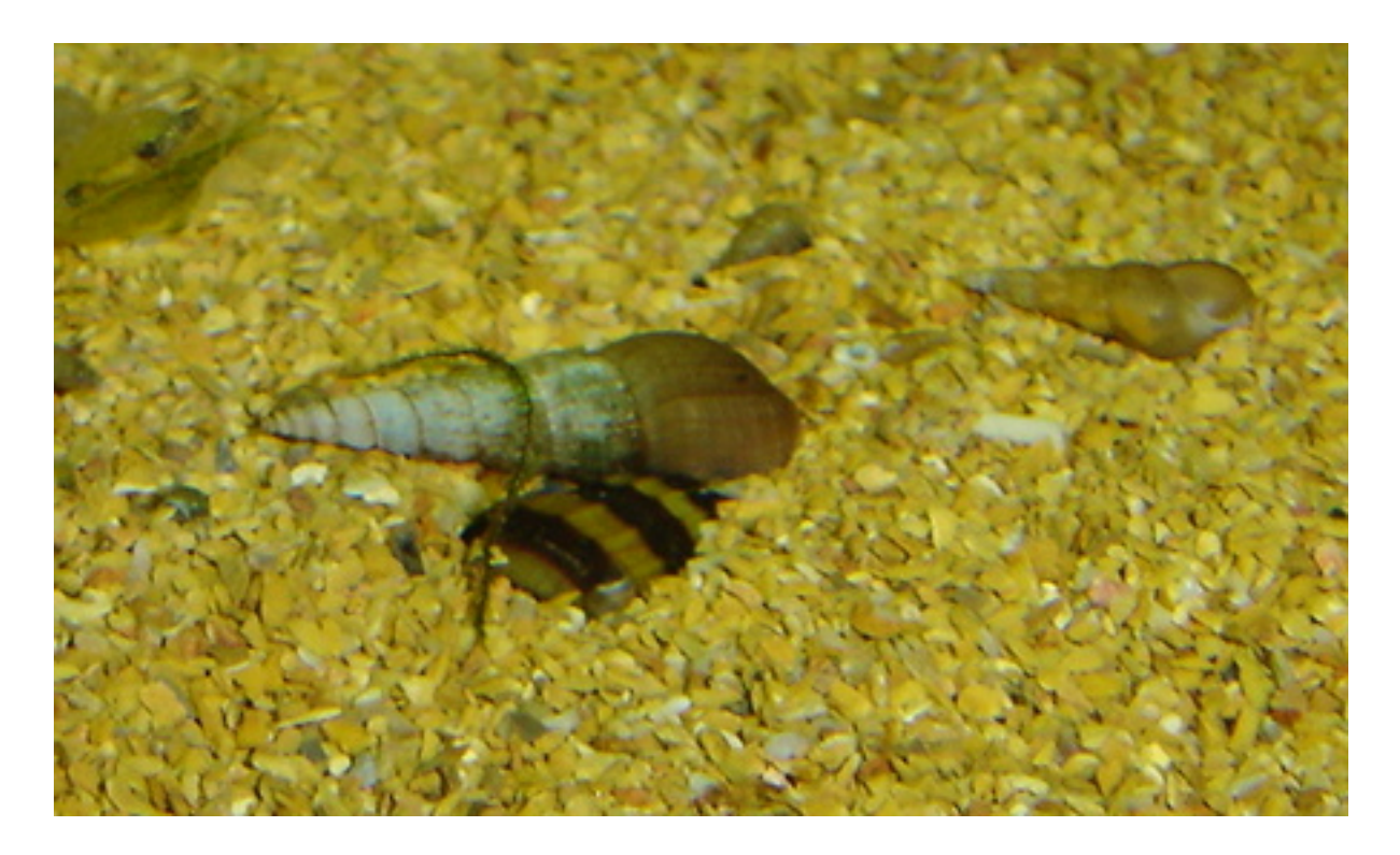
Empty Malaysian Livebearer snail shells & partially buried Assassin snail

So far information is scarce but this is what I have been able to learn so far. They are fresh water and have a shell with yellow and brown spiral pattern. They are natives of Southeast Asia and can be found in streams with sandy bottoms. They like to burrow into the sand when resting. These snails will eat pest snails even MTS. One article I read said they would only eat small MTS but have witnessed two of them tackling a large MTS, the shell in above picture is what was left in the morning. They are quite active through out the day. Sexing so far is unknown. I have witnessed two moving around the tank joined together so assume it takes two to breed. Some say they are okay with fish as tank mates, but I was afraid the fish might nip and hurt them unintentionally. So I personally have only kept them with large apple snails and cherry shrimp. I have heard that if there are no snails to eat they will not reproduce.