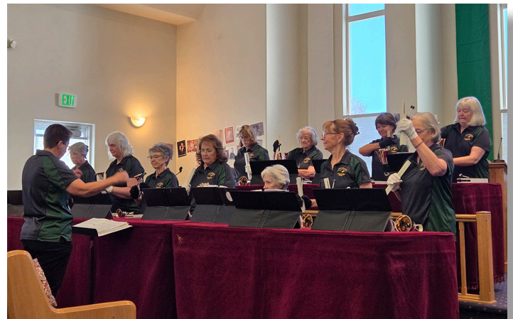
Sierra Ringers sport their new logo shirts and ring out beautiful music at early and late services.