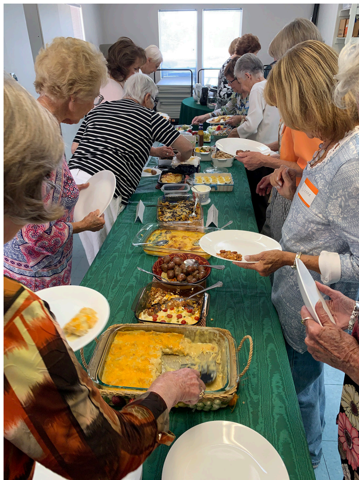
October UWF potluck.

Please join us on this exciting trip around the world for Food, Fun & Fellowship! We hope to see you there! (This event will be held in the CVUMC Fellowship Hall – no passport needed!)