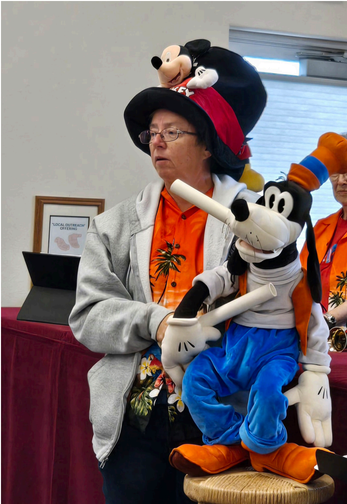
It is hard to tell just who is the leader here. Goofy has the PVC wand in his teeth and looks ready to conduct the Sierra Ringers in the Disneyland March. Lead on!