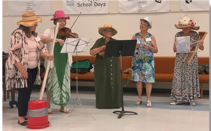
The Rag Tag Five "Band" performed "Oh, Nevada" at the annual UWF tea in August.

You can start reading now from the large selection of books in the church library under the UWF area. Any book you read on the list from the past 4 years will count toward next year's program. New books will in the library in January.