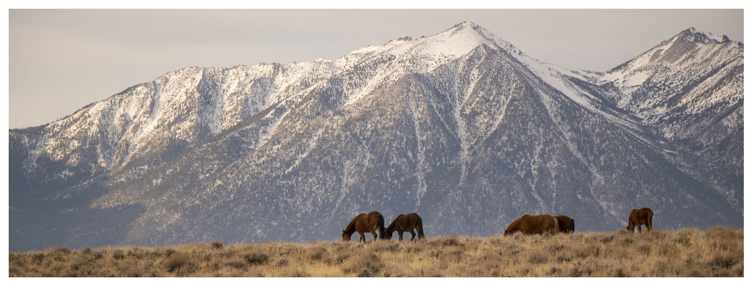
Monthly Publication of the Carson Valley United Methodist Church February 2024