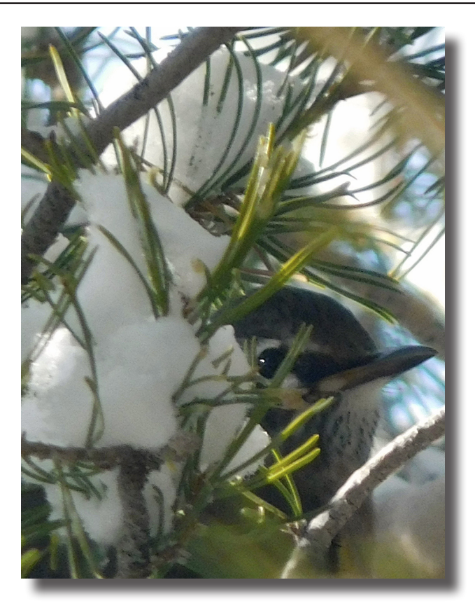
Yes, little robin, it is still wintertime out here, although it is hard to tell. Hang in there because more snow is coming.

Regular reading of response magazine or Faith Talk podcasts.