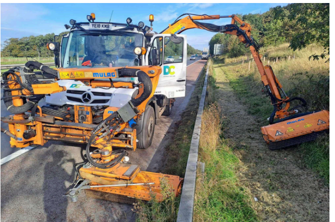
Our Unimog utilising it's flail attachments to cut vegetation on the highway networks.. (National Highways)