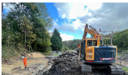
Invasive Weed: Japanese knotweed Eradication Method: Excavation

As industry experts, we are excited to be attending the 2024 International Invasive Weed Conference. The event will bring together professionals within the industry to discuss and collaborate on best practices for managing and mitigating invasive weed species. If you're attending, we would love to say hello.