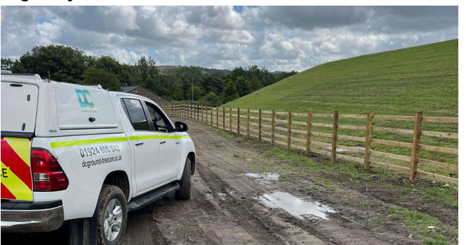
Supply and install of post and rail security fencing. (Kier Construction)