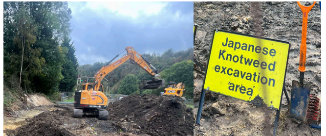
Invasive weed removal (Japanese Knotweed), including excavation, removal from site and ongoing monitoring. (Yorkshire Water)