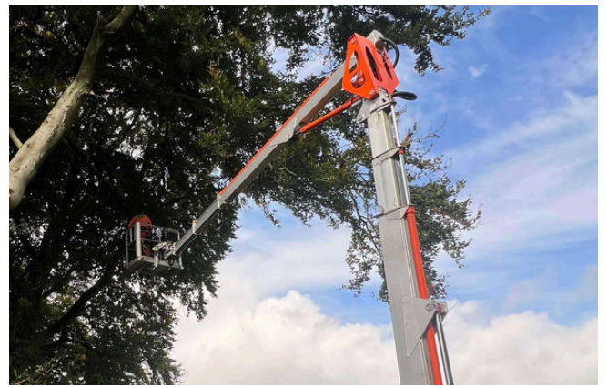
Our 25m tracked MEWP undertaking some tree works. (Severn Trent)