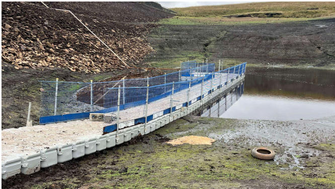
Supply and install of a floating modular pontoon system equipped with a pump designed to empty the reservoir prior to repair works. (JN Bentley Ltd)