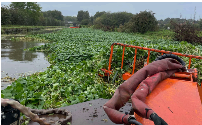
Large floating Pennywort removal job.