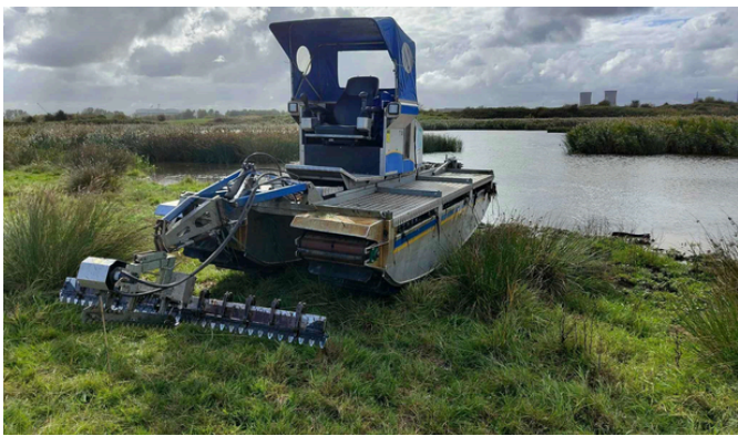
Our Truxors clearing aquatic weeds.