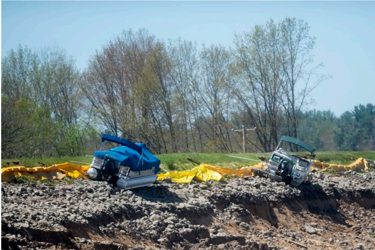
Two boats sit atop what remains of the Edenville Dam, washed up after severe flooding on Wednesday, May 20, 2020. 69

2603. The collapse of the Edenville Dam emptied Wixom Lake, sending the devastating force of floodwaters into Sanford Lake—the reservoir created by the Sanford Dam—which also nearly emptied into the surrounding communities. 70 The roaring water forced out of Wixom Lake as a result of the Edenville Dam collapse caused devastating and catastrophic damage to real and personal property located downstream of Wixom Lake.