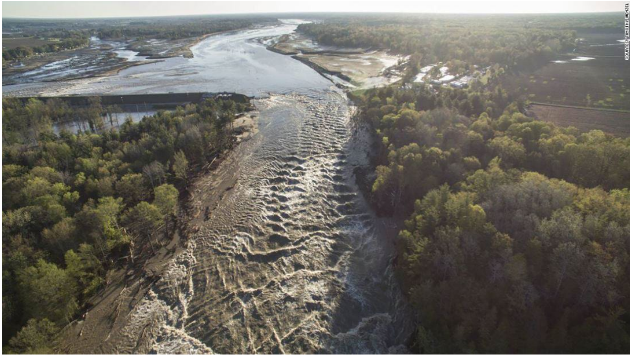
An aerial image taken by a drone shows the Edenville Dam breach on Wednesday, May 20, 2020. 64