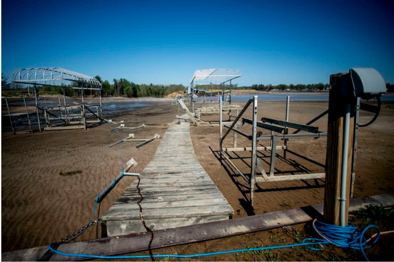
Washed out boating docks on Wixom Lake due to the failure of the Edenville Dam on Wednesday, May 20, 2020. 68