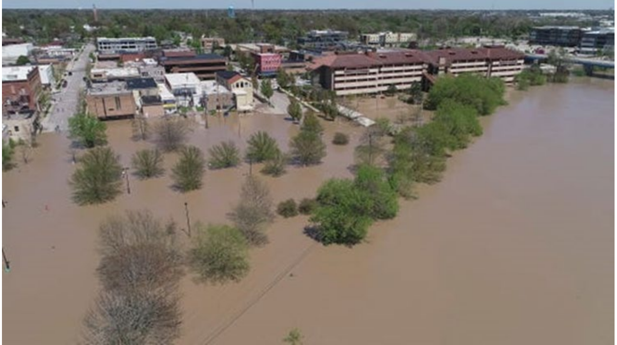
Aerial photo of flooding in downtown Midland, Mich., Wednesday, May 20, 2020. 62