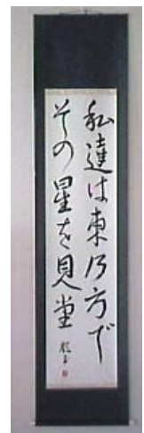
Figure 3: Sousho Style for Bird