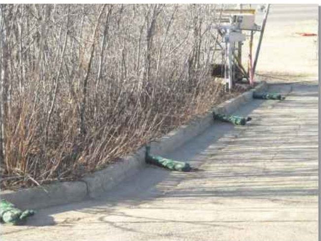
Photograph RS-1. Rock socks placed at regular intervals in a curb line can help reduce sediment loading to storm sewer inlets. Rock socks can also be used as perimeter controls.

A rock sock is constructed of gravel that has been wrapped by wire mesh or a geotextile to form an elongated cylindrical filter. Rock socks are typically used either as a perimeter control or as part of inlet protection. When placed at angles in the curb line, rock socks are typically referred to as curb socks. Rock socks are intended to trap sediment from stormwater runoff that flows onto roadways as a result of construction activities.