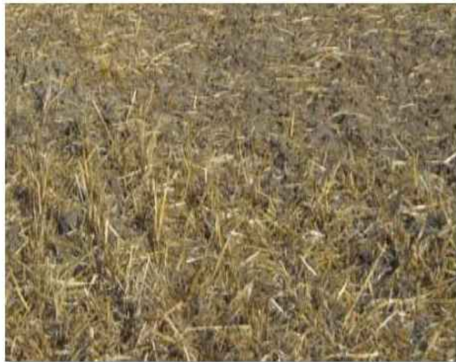
Photograph MU-1. An area that was recently seeded, mulched, and crimped.