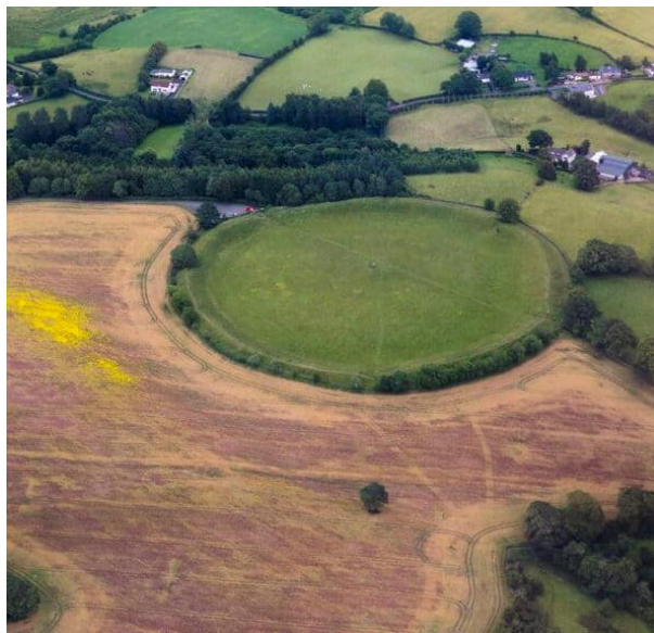
Giant's Ring, Ballynahatty, Ireland https://hayadan.com/4000-year-old-stone-circle-belfast