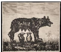
Image: William Kentridge: She-Wolf and Jugs 2020. Etching on Phumani cotton and sisal handmade paper mounted on raw cotton cloth.

Free and open to the public M-F: 10am-4pm