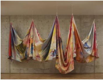
Sam Gilliam (American, 1933–2022), Carousel Merge 2, 1971. Acrylic on canvas: 186 × 102 in