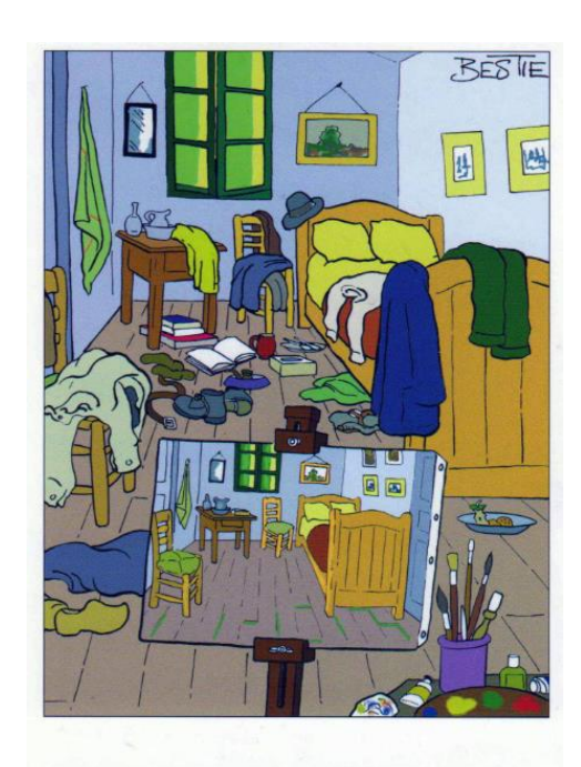
LIKE A LOT OF CREATIVE PEOPLE, VAN GOGH DIDN'T SEEM TO SEE THE CLUTTER