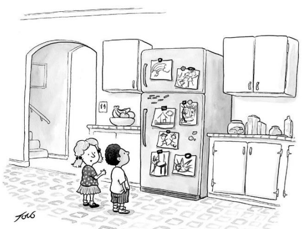
"I approach my subjects with an almost childlike sense of wonder."