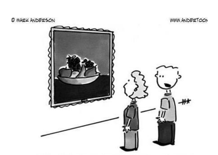
"I don't think it's a metaphor for anything. I think it's a bowl of fruit."