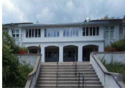
This is the rear of Lake Park Bistro

December 11, 2021 9:30 am Party will be held at Lake Park, 3133 E Newberry Blvd in the Marcia Coles Community Room, walk around to the east side of the building housing the Lake Park Bistro