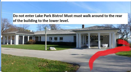
Do not enter Lake Park Bistro! Must must walk around to the rear of the building to the lower level.

These 2 maps should help you but don't forget your GPS/Google Maps or MapQuest, etc. are your friends! The easiest way there is to enter Lake Park off Newberry BLVD. You will park in the lot in front of Lake Park Bistro and walk behind it to the entrance of the Community room which is facing the lake. PLEASE do not enter the Bistro itself!