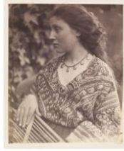
Julia Margaret Cameron

Every month I'll search out an artist who is a little off the beaten path. Maybe you'll already know about this artist, or maybe he/she will be new to you. Either way, I hope you enjoy this mini bio and perhaps learn something you didn't know!