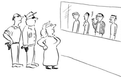
"Yup, that's them—the same artist lineup of the last biennial."

I'M TRYING TO EXPLORE MY DARK SIDE, BUT I'M BEGINNING TO WORRY THAT I MAY NOT HAVE ONE