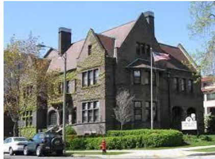
The Charles Allis Art Museum

The dates scheduled are September 5th - November 15 th , with an Opening on Thursday, September 19th 5:00pm -7:00pm. Details are being worked on but start planning now! We will sending details as soon as they are set! Happy Anniversary to us!