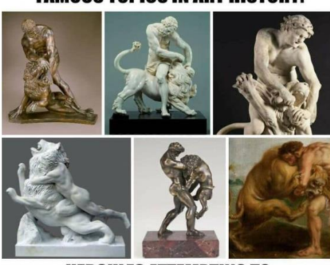
HERCULES ATTEMPTING TO GIVE HIS CAT A PILL