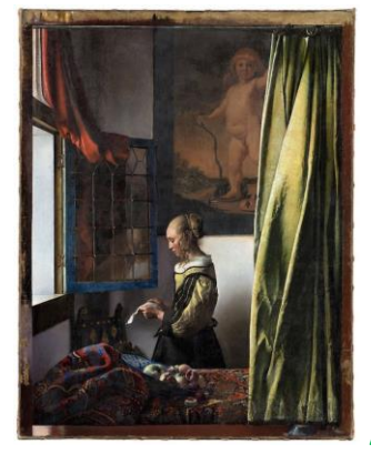
A restored Vermeer!

https://realismtoday.com/c-w-mundy-on-the-authorship-of-painting/